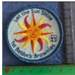
Let the Sun Shine Challenge