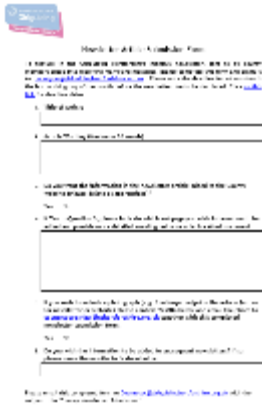
Word submission form